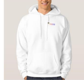
Calliope Unisex Hoodie