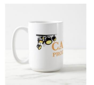
Calliope Productions 15oz Mug