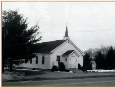
Figure 2 St. Mary of the Hills Chapel