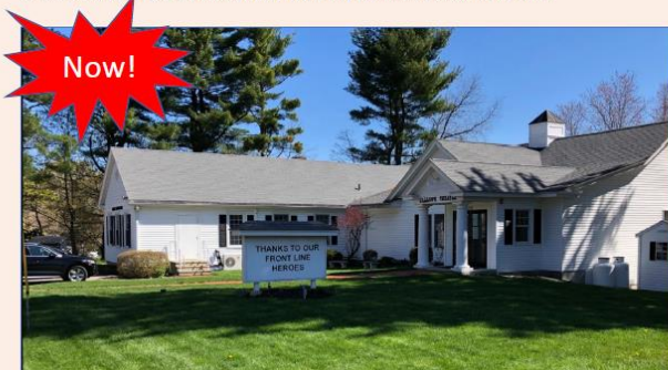
Figure 3 Calliope Theatre 150 Main Street, Boylston, Massachusetts

We offer our gratitude and congratulations to Calliope staff and performers as they celebrate 40 years of theatrical productions with an expanded repertoire of 8 shows in 2022.