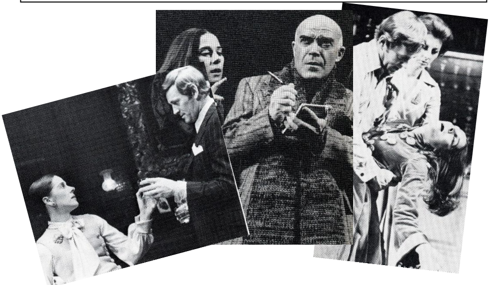
From left to right: Joan Hackett, Len Cariou, Joan Hackett, Keene Curtis, Len Cariou, Elaine Kerr, Joan Hackett

Scenes from the original Broadway production of "Night Watch"