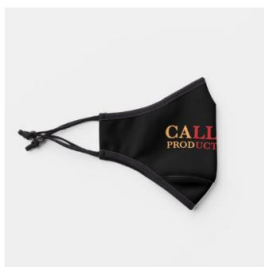
Calliope Productions Face Mask