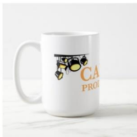
Calliope Productions 15oz Mug