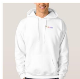
Calliope Unisex Hoodie