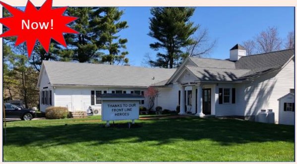
Figure 3 Calliope Theatre 150 Main Street, Boylston, Massachusetts

We offer our gratitude and congratulations to Calliope staff and performers as they celebrate 40 years of theatrical productions with an expanded repertoire of 8 shows in 2022.